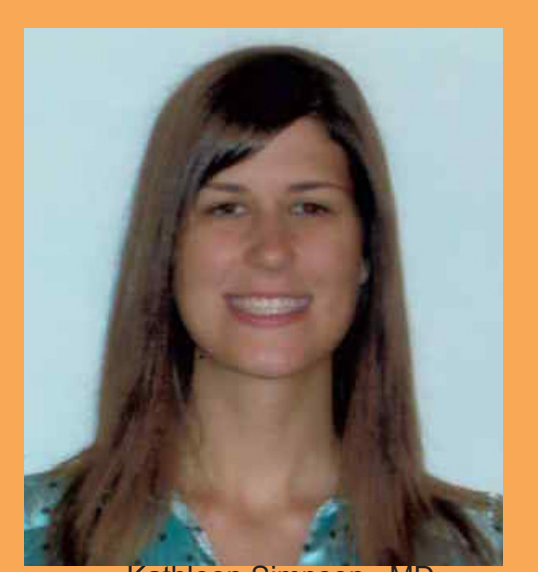
Washington University, St. Louis

Among children, myocarditis is an uncommon but serious disease. Recent outcome studies suggest a majority of patients recover normal heart function, but 30% will die or require heart transplantation within 3 years of diagnosis. Some patients will go on to develop significant chronic disease, with dilated and poorly functioning hearts described as dilated cardiomyopathy. Myocarditis is felt to account for 30-35% of patients with dilated cardiomyopathy in Australian and North American pediatric cardiomyopathy registries. Animal and human studies have demonstrated the importance of antibodies against the patient's heart muscle in direct development of disease. The relationship of autoimmunity in the pathophysiology and outcomes of pediatric myocarditis is unknown. Through the collaboration of regional pediatric hospitals encompassing the states of Misssouri, Oklahoma, and Nebraska, we plan to determine the relationship of autoimmunity to outcomes in previously and newly diagnosed pediatric myocarditis. In addition, we will use MRI of the heart to determine specific findings in children and the role of MRI in disease progression and prognosis for children with myocarditis. Improving the understanding of patient immune reaction in myocarditis may lead to improvement in prognosis and treatment in children.